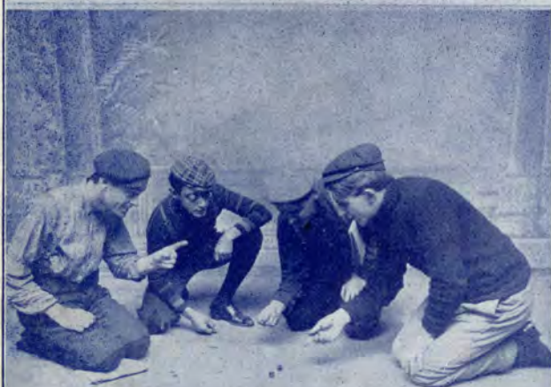
AMERICAN NEWSBOYS QUARTETTE

D. S. ANDRUS & CO. Piano Warerooms. (Established 1860) 21 West 3rd St., WILLIAMSPORT, PA.